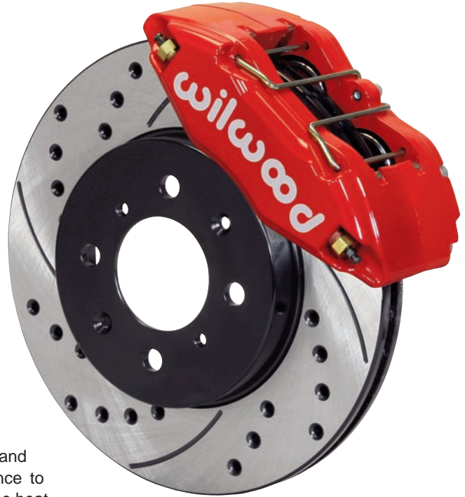
Front Kit Assembly with Red Caliper and SRP Rotor