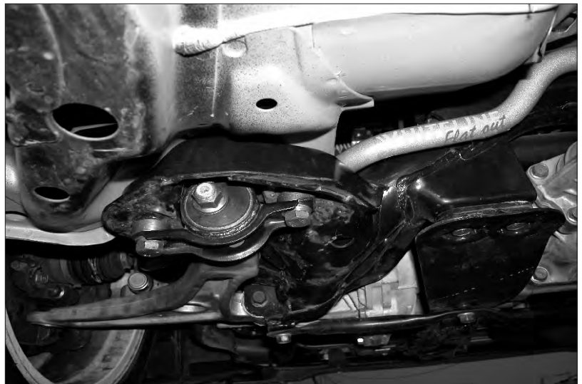
Fig. 3 - Note RHS, offset bushing installed for caster gain.