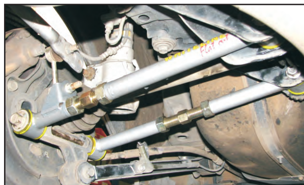
Photo 2 - rear view of left-hand side.