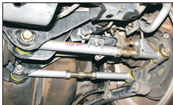
Photo 3 - rear view of right-hand side.