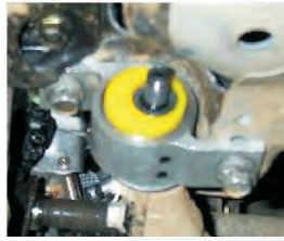
View of right hand side of vehicle showing correct maximum positive caster position

This kit should be fitted with the vehicle at normal ride height. That is, using a 4 post hoist or ramps. The vehicle will require minor adjustment to front toe settings after fitting.