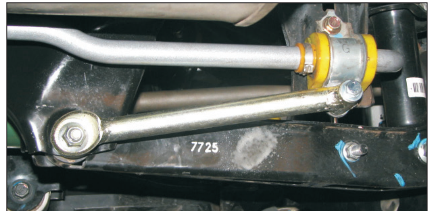
Fig 3 - RIGHT brace, rear view.

Warning: Please drive carefully while you accustom yourself to the changed vehicle behaviour