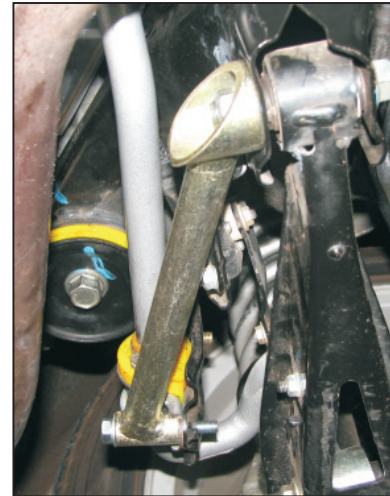
Fig 1 - LEFT brace