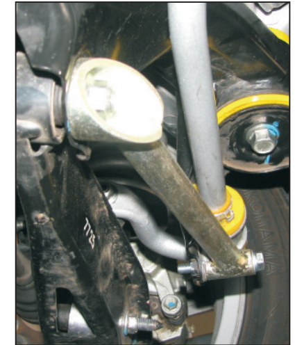
Fig 2 - RIGHT brace