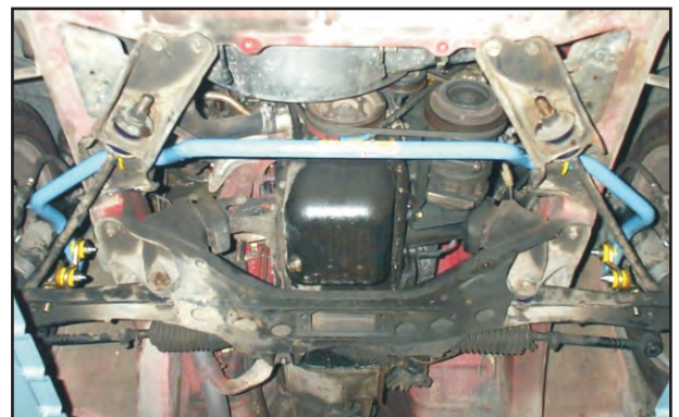
Photo 2. BTF35Z complete assembly

Warning: Please drive carefully while you accustom yourself to the changed vehicle behaviour.