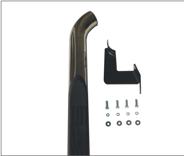
DRIVER FRONT -