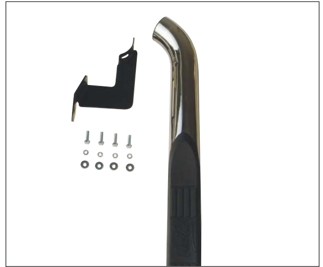
PASSENGER FRONT -