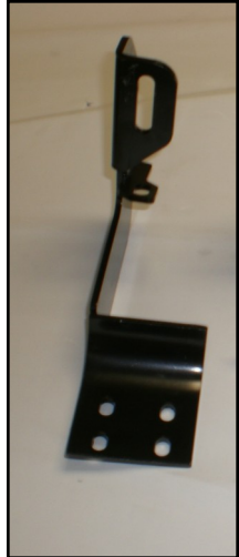
Right-side mounting brackets (Item 3)