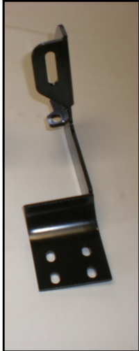
Left-side mounting bracket (Item 2)