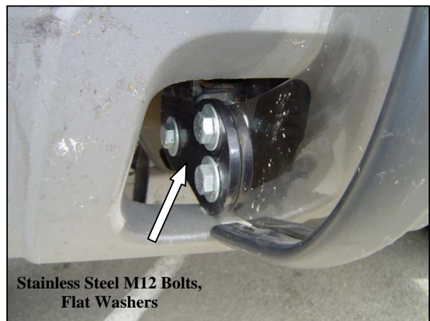
Stainless Steel M12 Bolts, Flat Washers