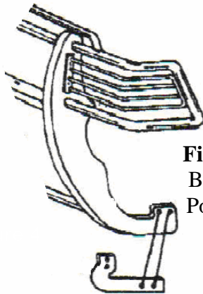
Figure 1 Bracket Position