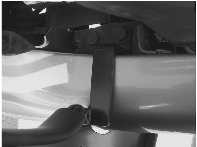
Passenger Side Upper Brace