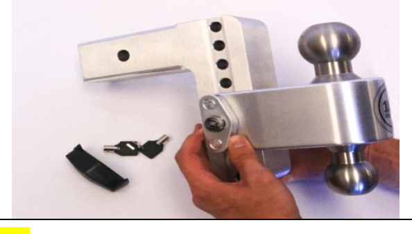
STEP 4: Pull on the <u>Key Lock Assembly</u> to ensure that it has engaged and place the <u>Dust Lock Cover (E)</u> over the lock. Do not operate without making sure the <u>Key Lock Assembly</u> is securely locked in place.