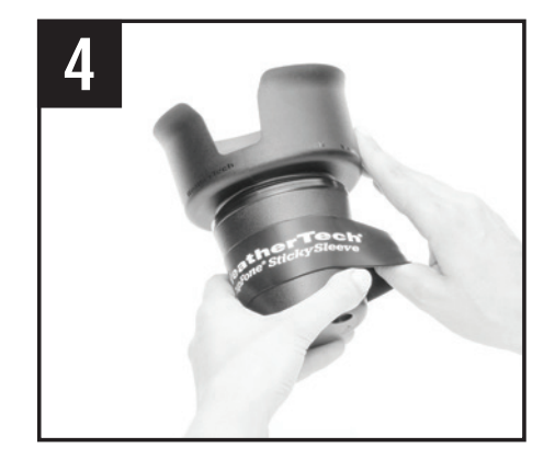
For extra stability, add StickySleeve. Simply stretch it over the appropriate base cup, far enough up the cup to have the StickySleeve appear just above the top of your cup holder.