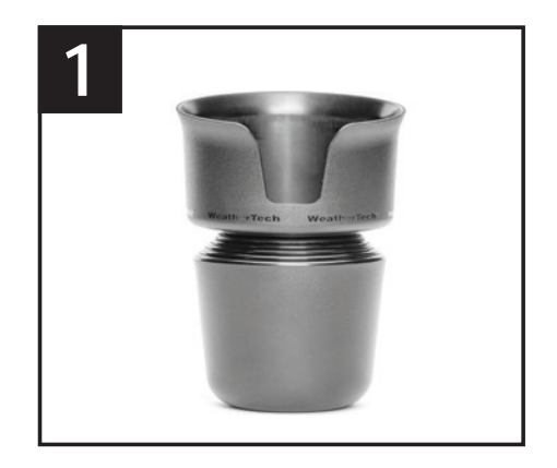
CupCoffee comes with several base cups to perfectly fit your vehicle's cup holder.