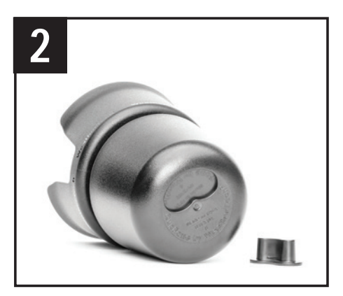
To separate your base cups, align the separator tool with the hole on the bottom of each cup. Ensure only one opening on the bottom is visible at a time.