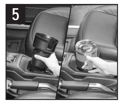
Insert your CupCoffee into your cup holder, and then slide your 14 oz. tumbler into CupCoffee. Place tumbler handle in specially-designed side opening.