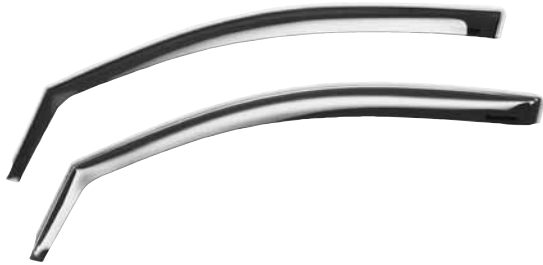
(2) Front Side Window Deflectors