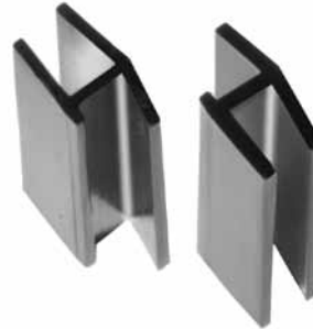
(2) Weatherstrip Clips