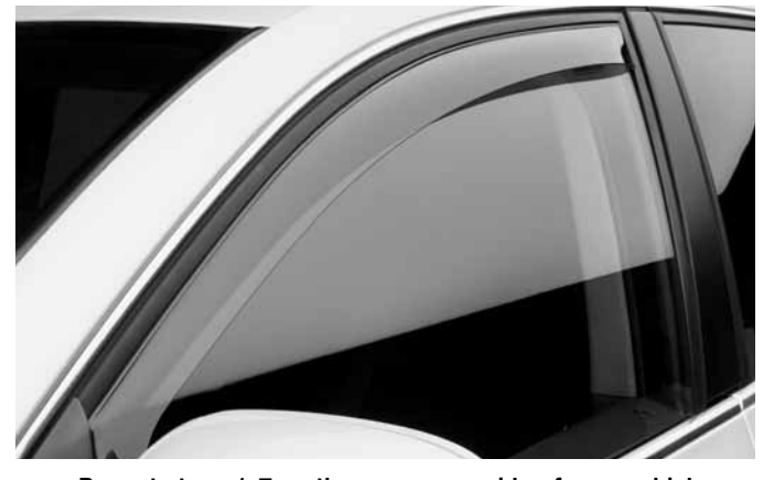
Repeat steps 1-7 on the passenger side of your vehicle. CONGRATULATIONS! Your Side Window Deflectors have been properly installed.