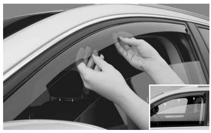
Carefully pull outward to set the deflector while rolling the window up slowly.