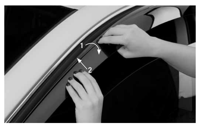
Starting from the front of the part, begin tucking the flange into the window channel.