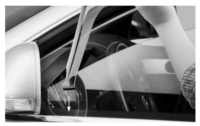
Lower the front of the deflector onto the weatherstrip as shown. The weatherstrip molding may differ from vehicle to vehicle.