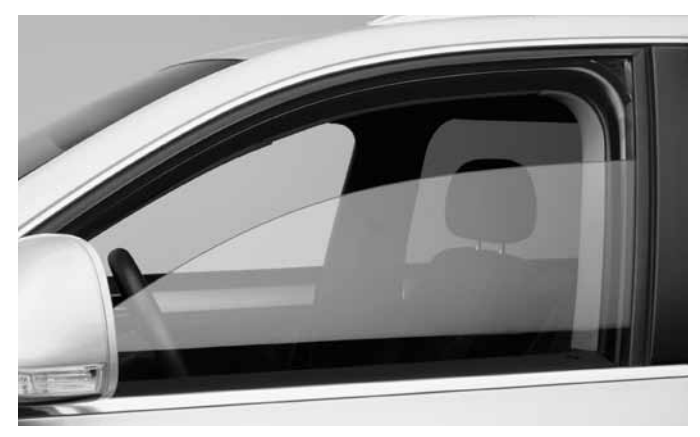
Make sure that windows are clean and dry. Then, lower windows half way.