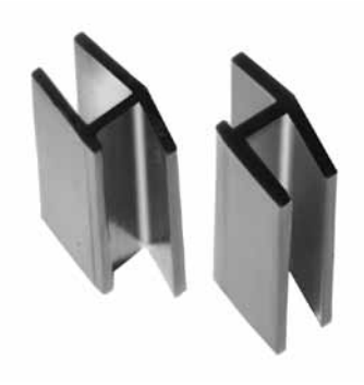
(2) Weatherstrip Clips