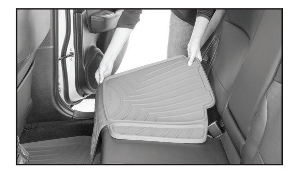
Place Child Car Seat Protector on top of the vehicle seat. Front flap should fall over the front of the seat.