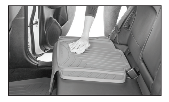
To clean Child Car Seat Protector, simply wipe with a soft damp cloth and/or mild detergent. For best results, use WeatherTech TechCare® FloorLiner and FloorMat Cleaner.