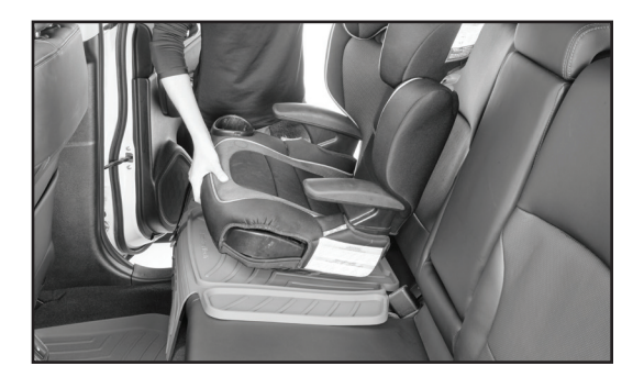
Place your child car seat on top and strap it in as you normally would, adhering to all safety recommendations.