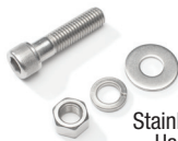
Stainless Steel Hardware (Available only with the BumpStep®XL with Theft Deterrent Stainless Hardware)