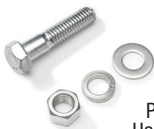
Plated Hardware (Available only with the BumpStep®XL with Plated Hardware)