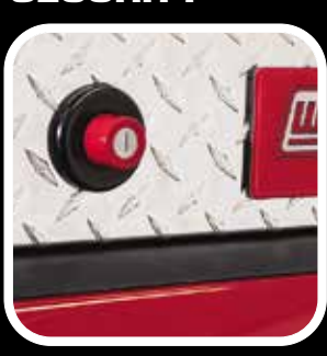
Tamper Resistant Push Button Locks