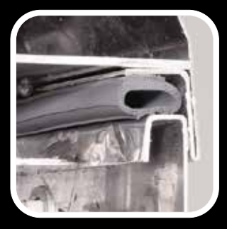
D-Shaped Ribbed Weather Seal