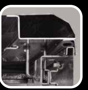
4 Piece Construction