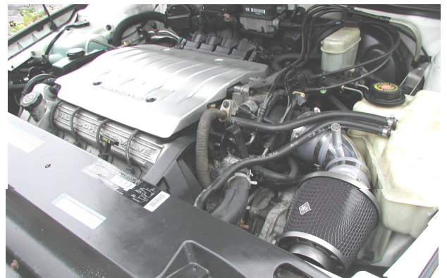
1994-03 Aurora V8 4.0L installed pictured above