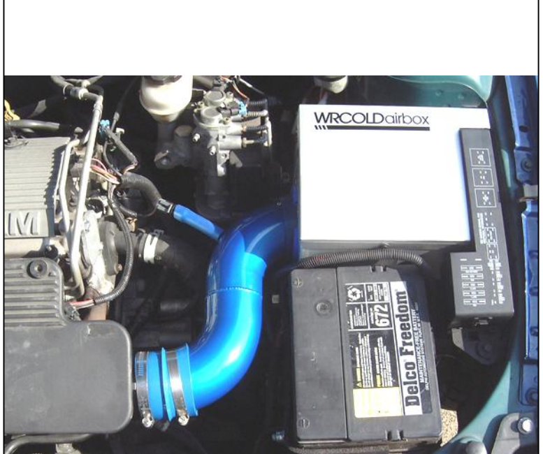
Intake with eclosed aluminum air box installed.