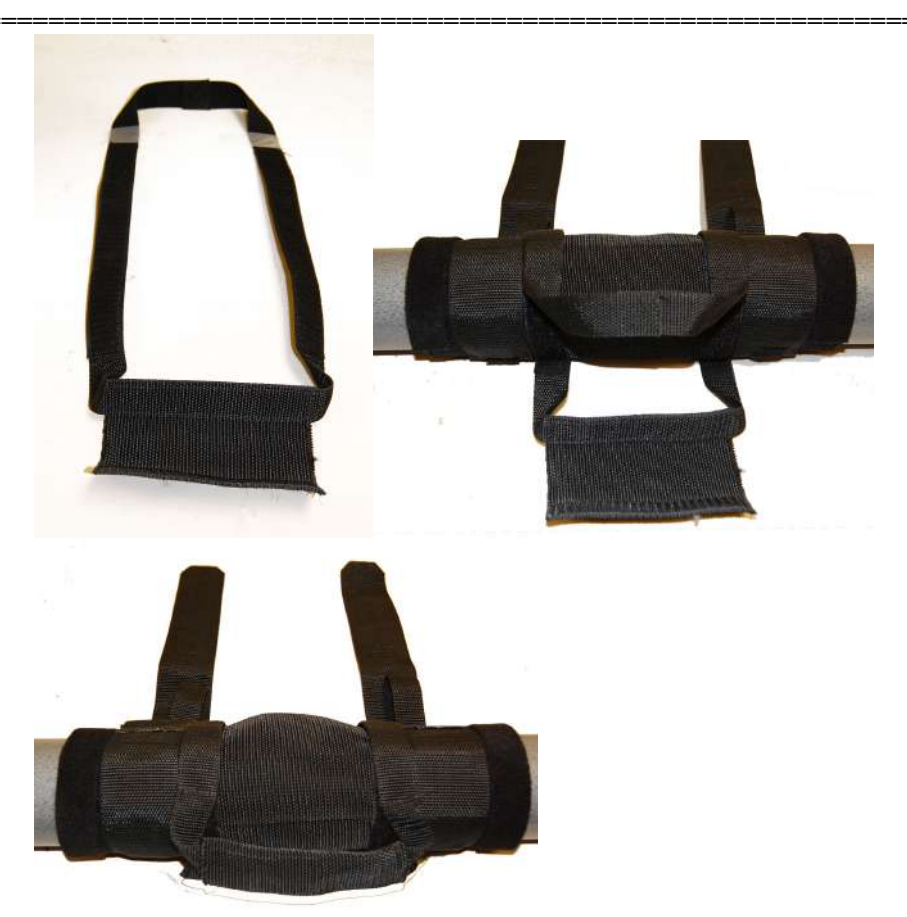
Figure 5 Figure 6 Figure 7

6. Next, install the fire extinguisher. Begin by sliding the extinguisher through the closed loops on the combo grip.