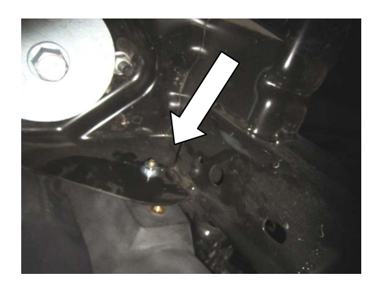
4. Attach the bumper with the provided hardware.