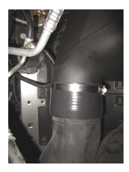
1. Attach the 4 x 3 sleeve to the volant box and tighten the #64 clamp.