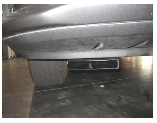
6. Attach the 3.75 x 3.5 sleeve and lower scoop using the #60 clamps