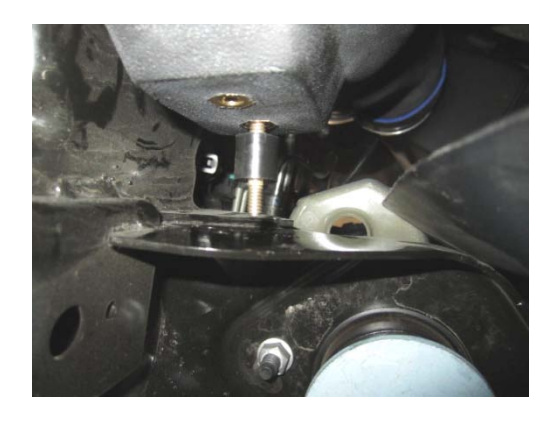
3. Align the rubber bumper with the existing hole on the frame