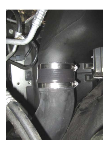
5. Attach the remaining #64 clamp onto the upper half of the scoop.