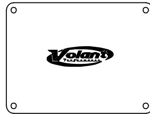
FILTER BOX LID