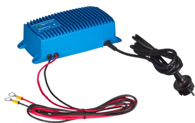
Blue Smart IP67 Charger 12/25