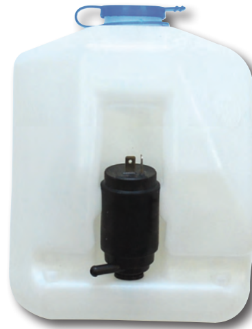
Bottle dimension: 7 3/4" Tall x 6 1/4" Wide x 4 3/4" Deep