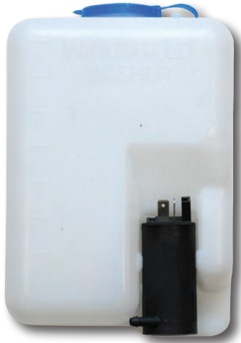
Bottle dimension: 7 7/8" Tall x 5 1/4" Wide x 4 1/4" Deep

The factory windshield washer bottle installed on most vehicles is a major inconvenience because they are often very large and take up so much space. This is especially true for anyone who has ever installed a turbocharger or supercharger on their car, or simply needed to free up space in their engine bay. Many people simply remove the stock bottle and hope they will never need it. Vibrant Performance now offers a choice of two compact universal washer bottle kits that include everything you need to replace the OEM bottle.