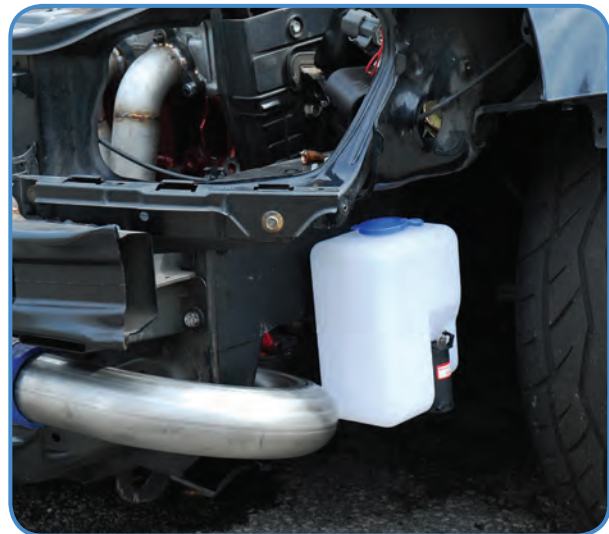
Vibrant Performance washer bottles are very compact allowing much more space for aftermarket add-ons.