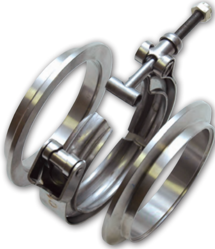
Vibrant V-band Flanges feature a unique male/female locking design to ensure proper flange alignment

Vibrant V-Band Flanges feature a unique "Male/Female" design to ensure proper alignment inside the clamp. Flanges are available in both T304 Stainless Steel or T6061 Billet Aluminum construction. V-Band Clamps are made from 300 series Stainless Steel.