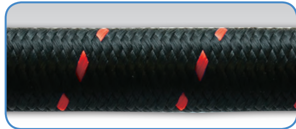
Black/Red Nylon Braided Flex Hose