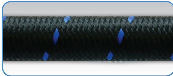
Black/Blue Nylon Braided Flex Hose