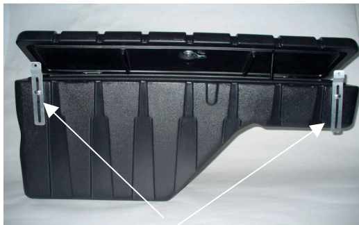
Fig. 2 Install Brackets to Box