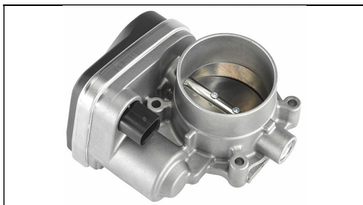
1 - Product