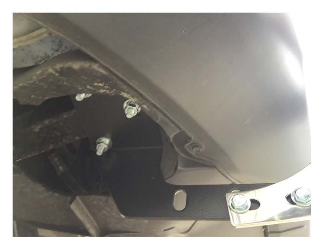
Driver's Side View