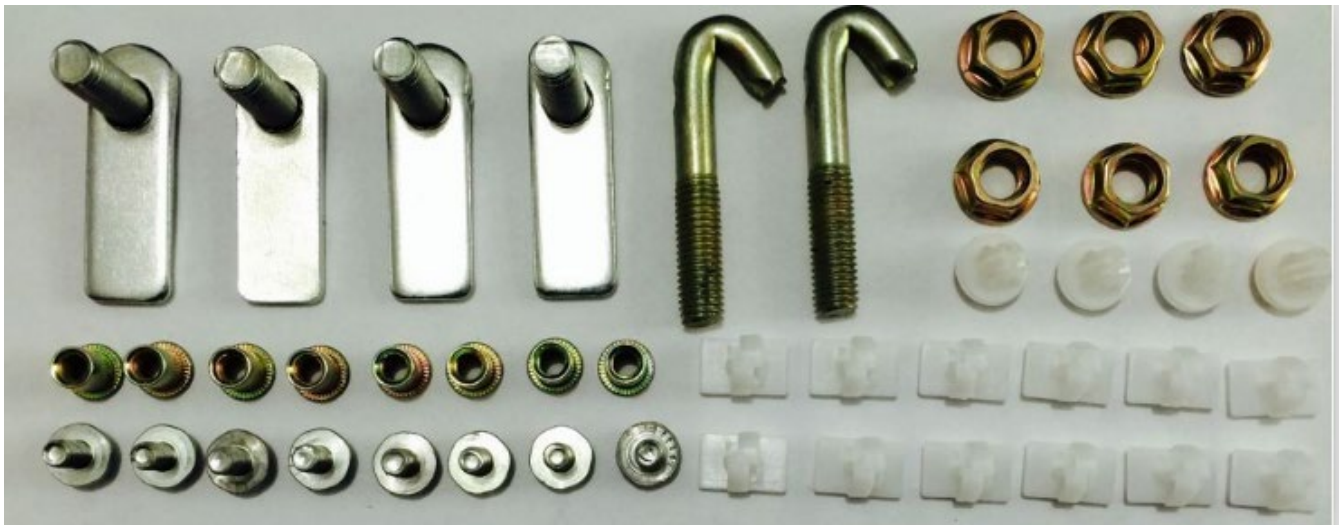
Figure 1: Parts List

Figure 2: Take the left side as an example. Remove the original side beam and expose six holes on the side. Insert the expansion nut at the 2-5 hole position, the 2.3 nut is placed at the front end of the hole, and the 4.5 nut is placed at the rear end of the hole. Remove the black plug and hang the steel hook. T-hooks are hung on the bottom of the middle of the 2.3 hole position and the middle of the 4.5 hole position.