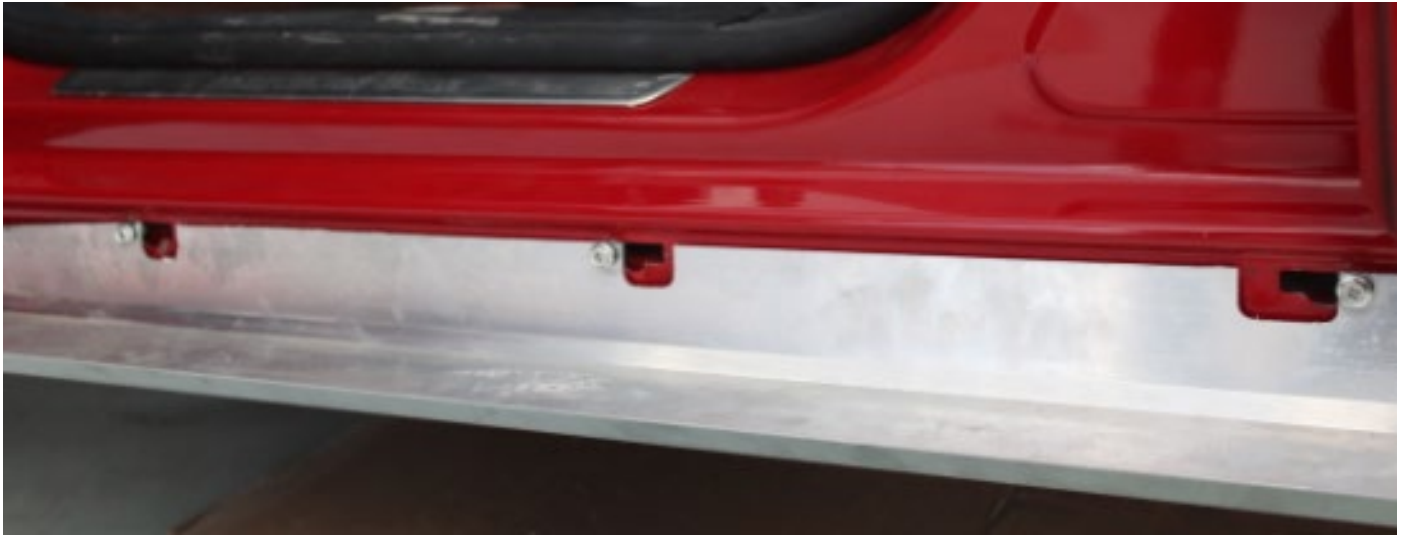
Figure 4: Attach the pedal to the plastic part of the pedal, install the pedal, and cover the plastic cover. The installation is complete.