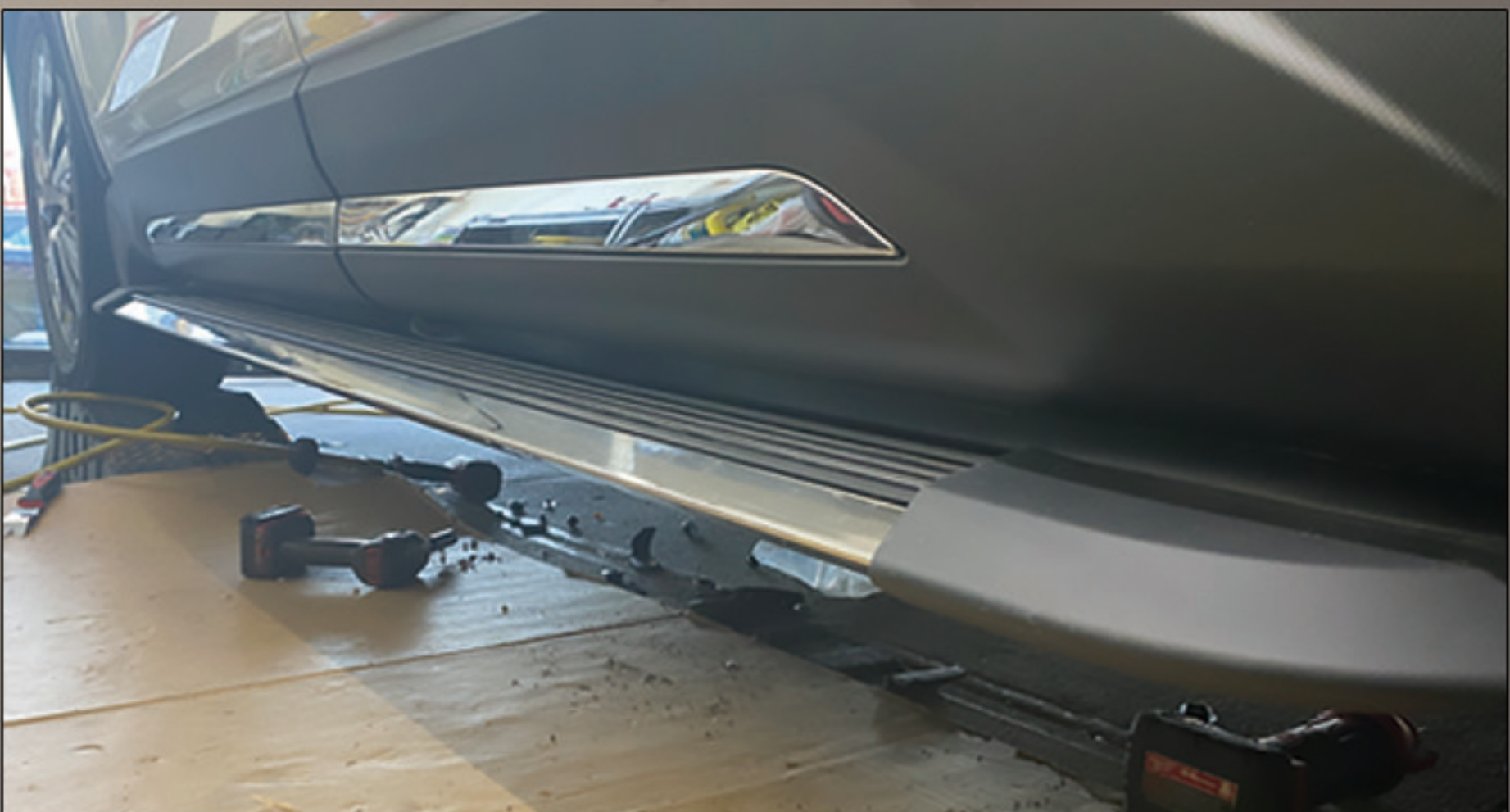
13. Complete the pedal installation.