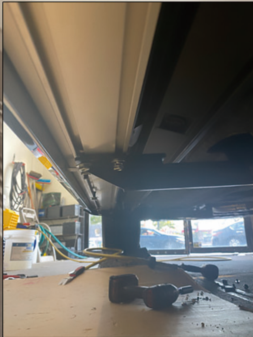
12. Pedal fixed installation completed