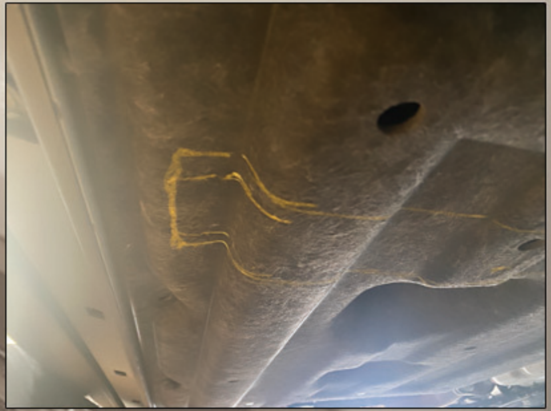
2. Draw the installation position of the bracket on the fender.