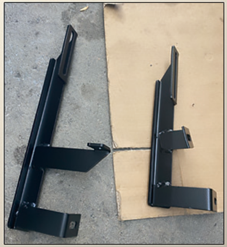
1. Prepare tools and fender brackets.