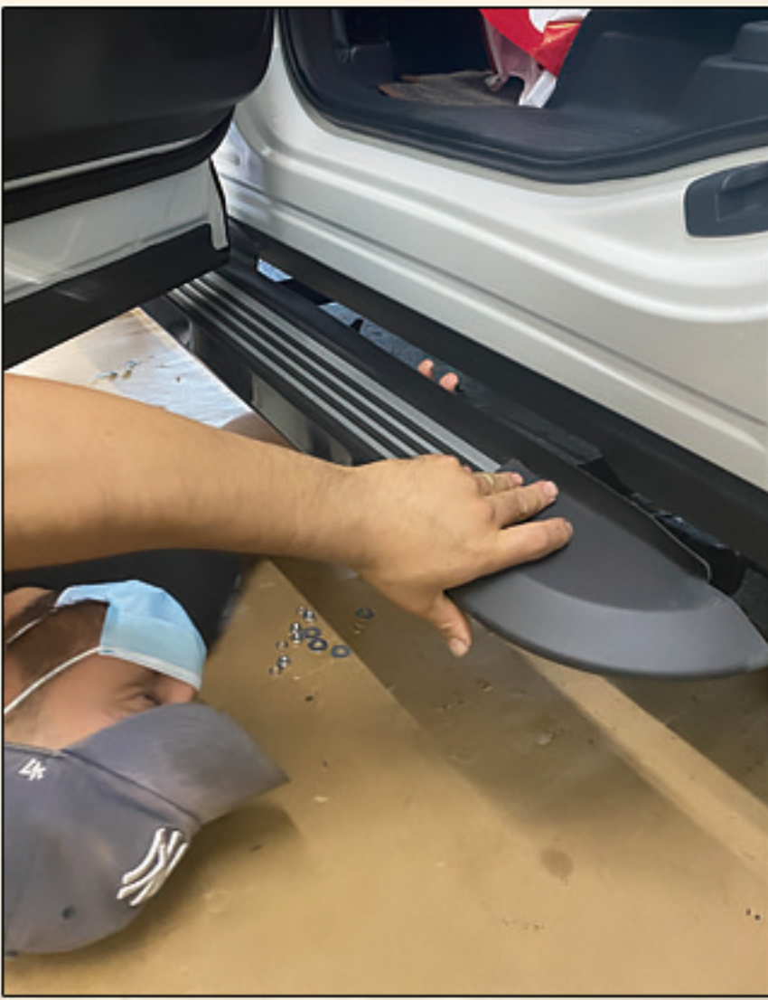
11. Reconfirm the installation height of the pedal.