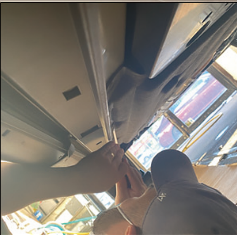
3. Remove the screws on a part of the mudguard.