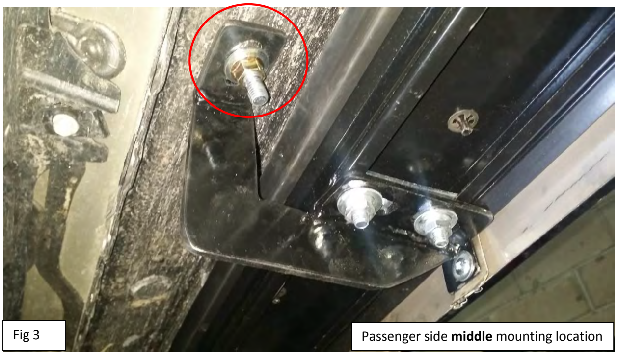
Fig 3 Passenger side middle mounting location

STEP3: Next, locate and remove the middle rubber plug. (Fig2)