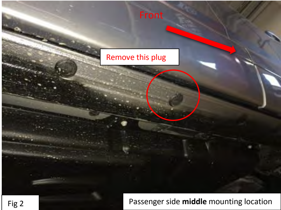
Fig 2 Passenger side middle mounting location

STEP3: Next, locate and remove the middle rubber plug. (Fig2)