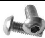
T : M6X15 Bolt (2PCS)