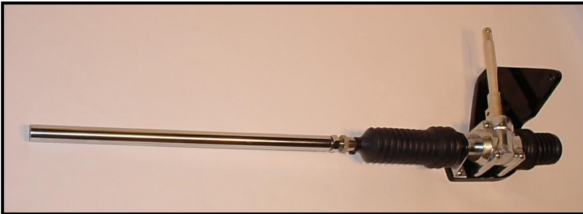
8000470-01 (shown above with Vega Replacement Shaft)

Due to variables outside our control these kits may not fit all applications. Also, please verify kit will fit your application before altering vehicle.