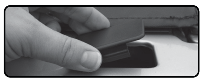
After the install is complete, snap the stake pocket covers into the stake pocket holes.

Warning! Clamps must be checked periodically for tightness. Failure to do so could result in damage to you or your property.