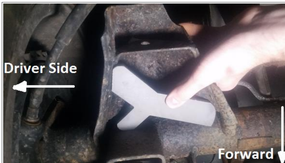
Figure 10 (Directly under the axle)