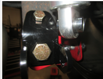
Fig 2 – Lower bracket location