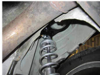
Fig 5 – Upper bracket install