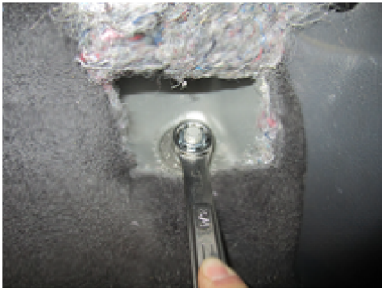
Fig 1 – Upper shock bolt