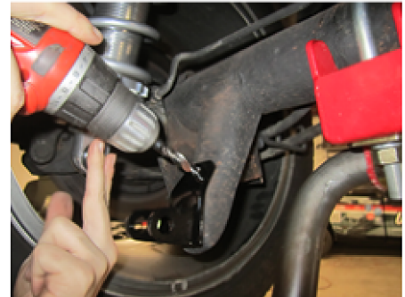
Figure 3 – Drilling for 3/8" reinforcement