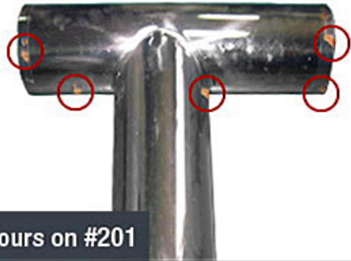
64 Hours on #201