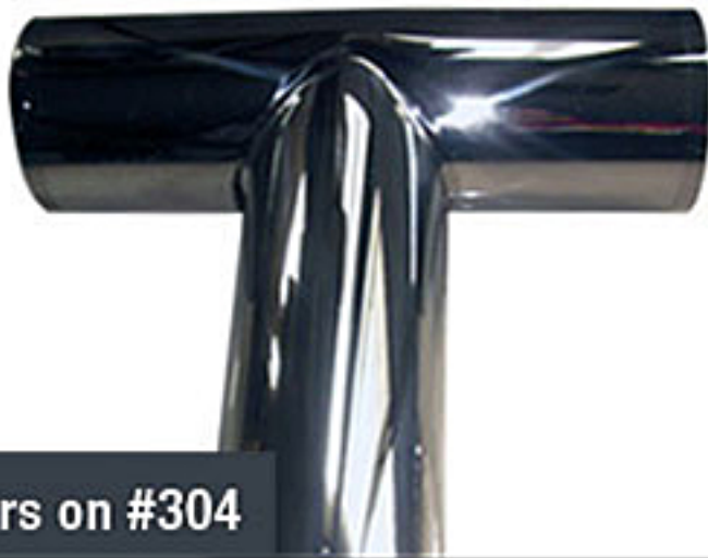
96 Hours on #304