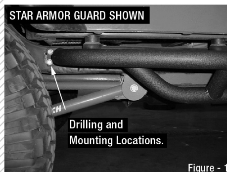
Figure - 1