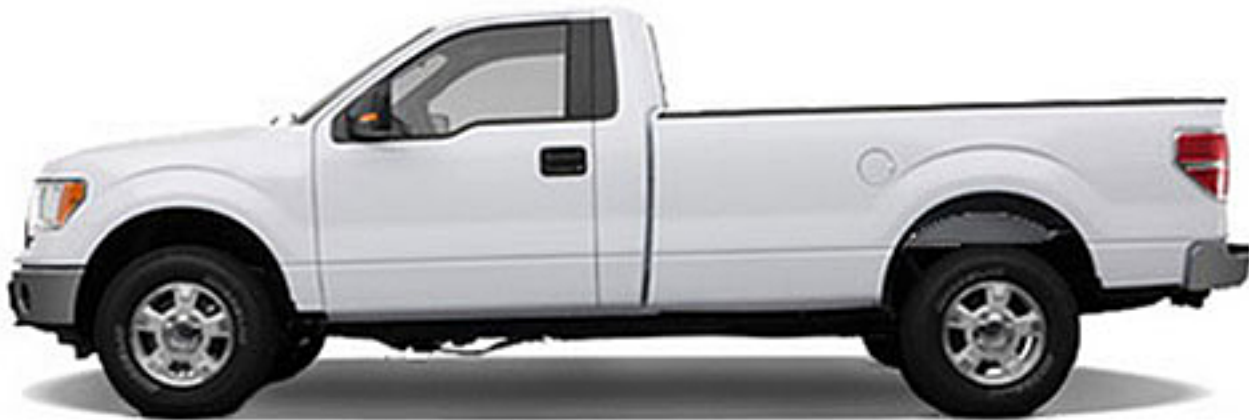
(2 Doors only)

Important: Before ordering, please check with your dealer to make sure your truck is with Super Cab, NOT Super Crew.