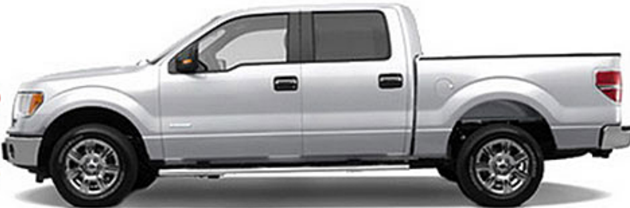
(4 Full-Size Doors )