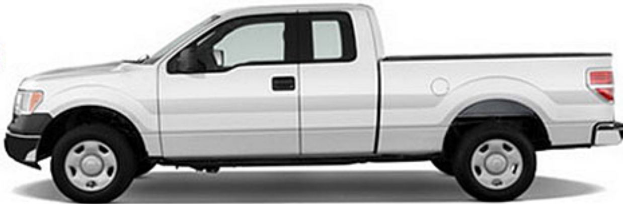
(2 Full-Size Front Doors & 2 Suicided Rear Doors)