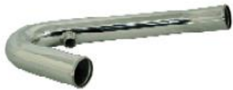
Illustration 7: Pipe 5b