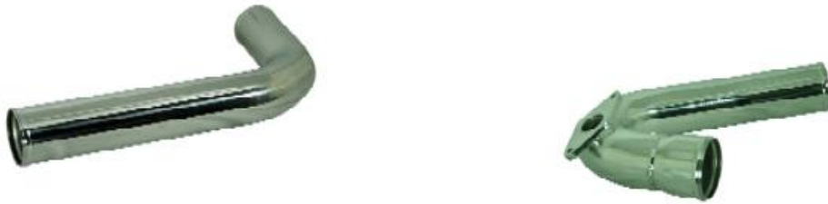
Illustration 8: Pipe 4