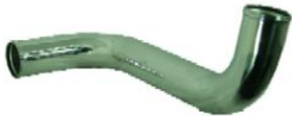
Illustration 4: Pipe 2