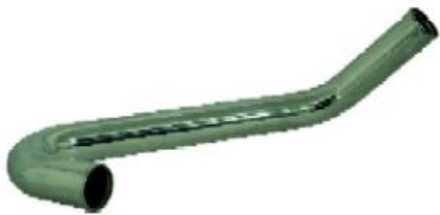
Illustration 3: Pipe 1b

In all installations, five (5) pipes are used to connect the turbocharger outlet to the throttle body inlet on the intake manifold. However, you will note that your TurboXS 2008+ Subaru WRX/STi FMIC comes with seven (7) pipes. This is because the WRX and STi have different turbocharger outlets and different intake manifolds. Therefore, the first pipe (coming off the turbocharger) and the last pipe (going into the throttle body) will be different depending on whether you are installing this kit on an STi or a WRX. Follow the instructions below and reference the individual pipe pictures as well as the installation pictures in this document to determine which pipe goes where.