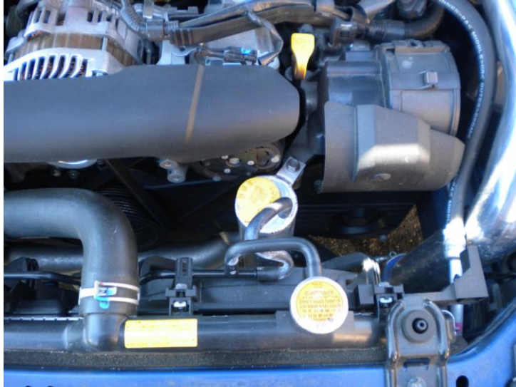
Illustration 9: Coolant Overflow Bottle Installed