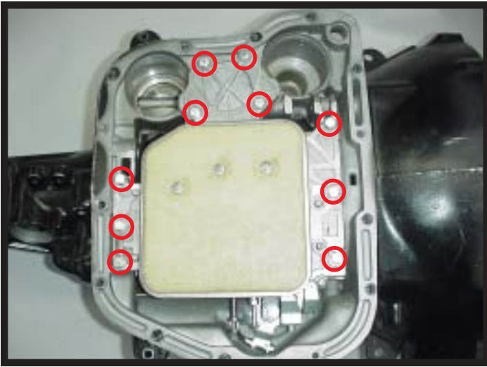
Fig. #1 Remove Ten Bolts