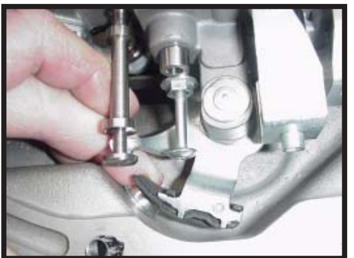
Fig. #6 Do Not Damage