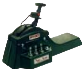
CHEETAH SCS Shifters