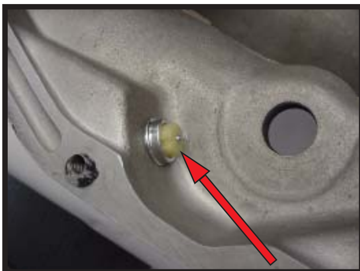
Fig. #5 Neutral Safety Switch