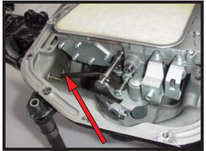
Fig. #2 Park Rod