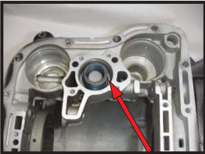
Fig. #3 Remove Spring(s)