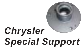
Chrysler Special Support