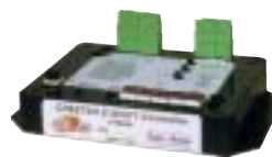
CHEETAH E-Shift Controller