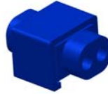
#9 Tap-in connector