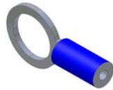
#12 Ring terminal