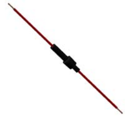
#7 Fuse holder