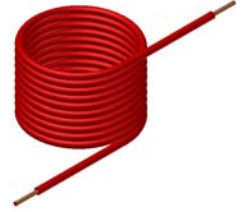
#5 Red Hot wire