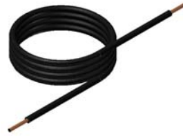
#6 Black Ground Wire