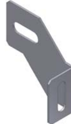
#5 MOUNTING BRACKET