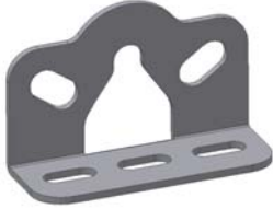
#1 - (4) Tie Down Brackets