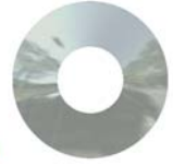
#2.2 - (16) 5/16" WASHERS