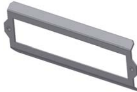
#2 Back plate