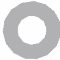
(16) 5/16" Washers