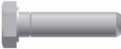
(8) 5/16" x 1-1/4" Bolts