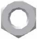
(8) 5/16" Nylock Nuts