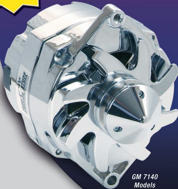
GM 7140 Models