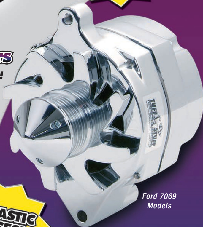
Ford 7069 Models