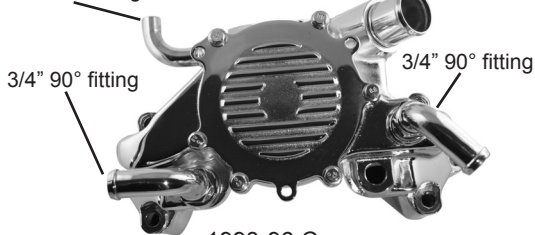
1993-96 Camaro 1994-96 Impala & Caprice